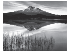
Tule and Mt. Shasta