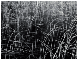
Frozen Tules $700