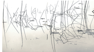
Miro Fish $800