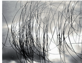
Khaos Tules $700