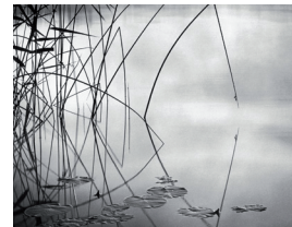
Lily Pads and Tules $1000